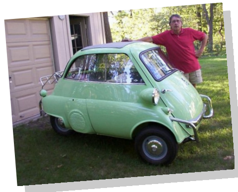
What's cooler than an Isetta?