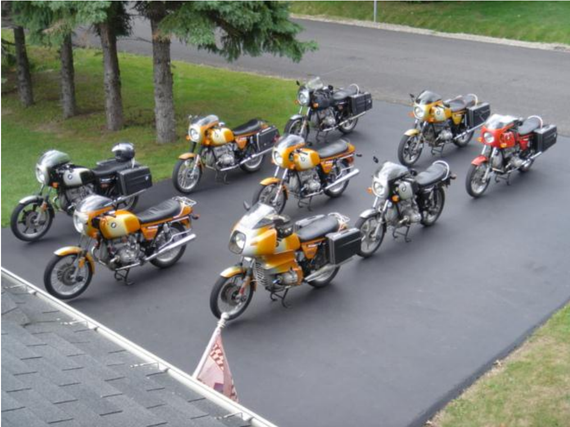
6th & Last Rally – Jamestown, NY

We are planning to hold an 11 th & Last R90S Rally. It will be held at or near the Vintage Display at the 2011 BMW Rally in Bloomsburg, PA. Anyone is invited to participate; you do not have to be a member of the National R90S Club. For R90S judging, we will award 1 st , 2 nd and 3 rd place plaques for People's Choice and a plaque for Long Distance Rider (bike must be ridden to the rally). More on this to come as plans develop. Send us any thoughts of what you want for the R90S Rally or if you'd like to help volunteer. In the meantime, we hope you'll enjoy these photos from past Last Rallies.