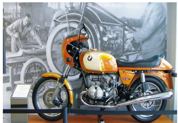
R90S at the BMW Mobile Tradition display.

I have travelled to Germany and the UK several times in the last twenty years and visited Scherb Knoscher in Munich and Siebenrock in Stuttgart and attended the BMW Bikermeet at Garmisch. At times I have seen bikes with Knoscher fairings and seats in my travels and thought they would suit my machine. On one occasion I was lucky enough for a personalised visit to BMW Mobile Tradition in Munich to view all the goodies and restoration workshops.