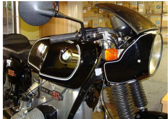
All done and fitted with Moto Guzzi Le Mans fairing & screen.

Back to work again with further mods fitting the Ceriani drum brake (see photo bottom, left), Hoske mufflers, 40mm pumper Dellortos, a /7 fuel tank and a modified Moto Guzzi Le Mans Mark 1 fairing and screen that in my opinion gives the bike a more retro look in the 70's café racer style. I am happy with the brake's performance and regard it as being close to or on a par with the standard ATE brakes, after all the Ceriani set up was used on many racing machines in the past. The photos are of the bike as it now stands and I think the end of the road in its final set up for its journey in my hands, a very satisfying project for myself and I hope not too offensive to all those with a love of the BMW R90S.