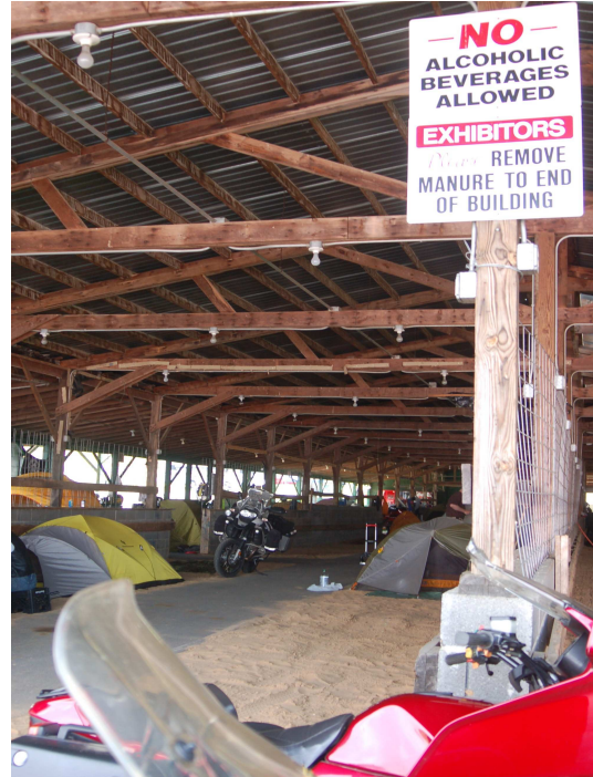
'Remove Manure' sign at indoor motorcycle camping

Even the camping accommodations were deluxe for those who arrived early & were able to camp in the covered livestock pens. The only drawbacks were listed on the sign prominently displayed at the entrance to the deluxe camping area. I think I could have handled the absence of beverages (the beer tent was just down the hill). I'm not too sure I could have handled the requirement to remove certain materials to the end of the building.