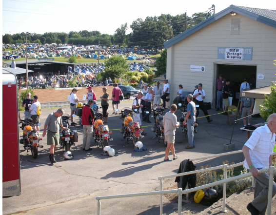
View of the R90S display outside the vintage display