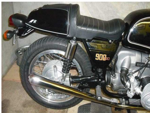
As now fitted with Knosher solo seat & Hoske pipes.