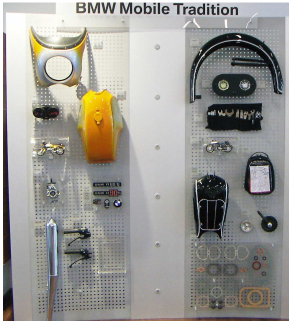
Parts goodies display – YUMMIE!

In the UK I came across a donor BMW of mixed heritage that had a genuine Ceriani 4LS (four leading shoe) drum brake, just one of those things you are lucky enough to find in your travels, and luckily a friend of mine living there, shared the cost of purchasing this machine. He took the bike and I the Ceriani brake which in turn I brought to Australia. On another visit to Germany I purchased a Knosher single seat. I would have liked the fairing as well, however I was not sure if it would fit. The head stock would need drilling to accept the bracketing for same. Scherb still has these seats and fairings available in the same 70's format depending on how much you wish to fork out and they have a web site if you wish to view their products.