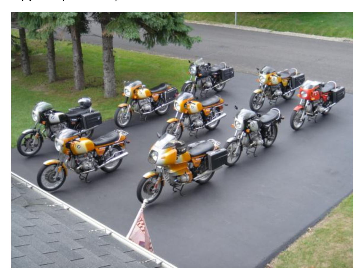
6th & Last Rally - Jamestown, NY

We are planning to hold an 11<sup>th</sup> & Last R90S Rally. It will be held at or near the Vintage Display at the 2011 BMW Rally in Bloomsburg, PA. Anyone is invited to participate; you do not have to be a member of the National R90S Club. For R90S judging, we will award 1<sup>st</sup>, 2<sup>nd</sup> and 3<sup>rd</sup> place plaques for People's Choice and a plaque for Long Distance Rider (bike must be ridden to the rally). More on this to come as plans develop. Send us any thoughts of what you want for the R90S Rally or if you'd like to help volunteer. In the meantime, we hope you'll enjoy these photos from past Last Rallies.